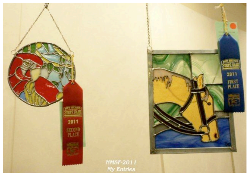
NMSF-2011 My Entries