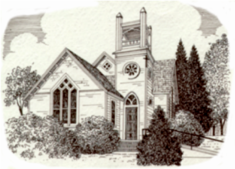
Estancia United Methodist Church, 600 Williams, Estancia, New Mexico

Sunday Worship 9:00 AM Nursery Provided Church School 10:30 AM