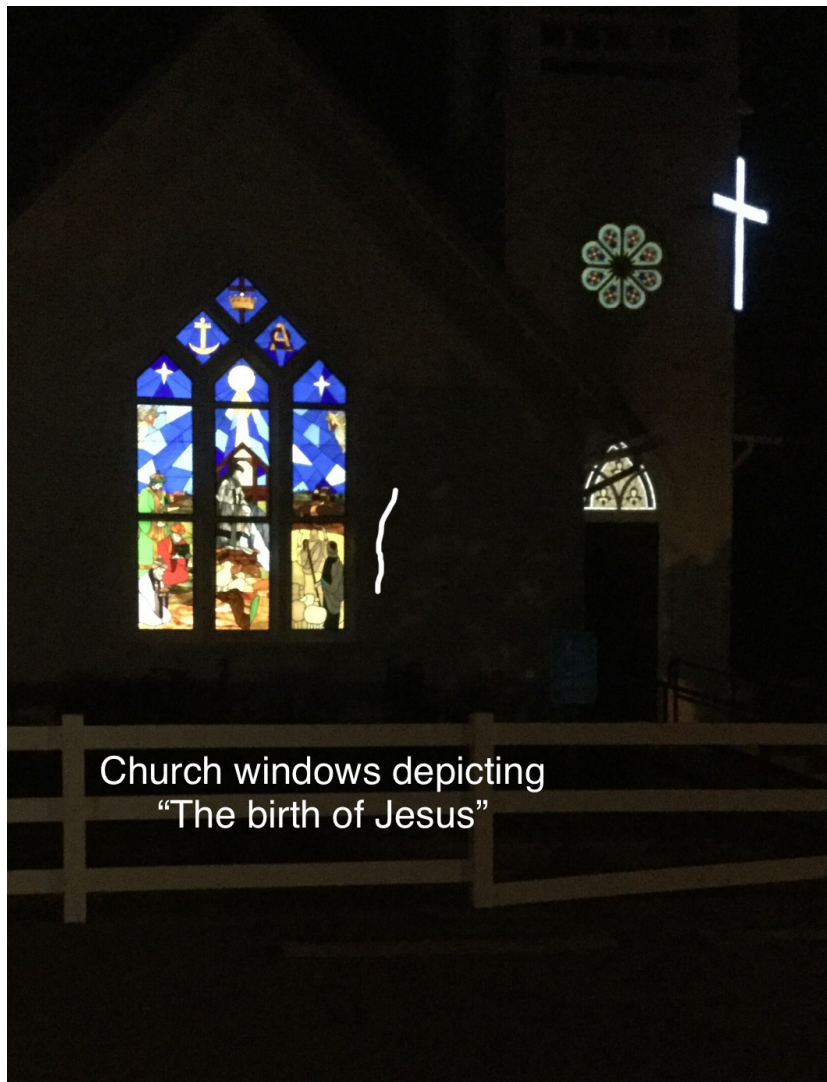
Church windows depicting "The birth of Jesus"