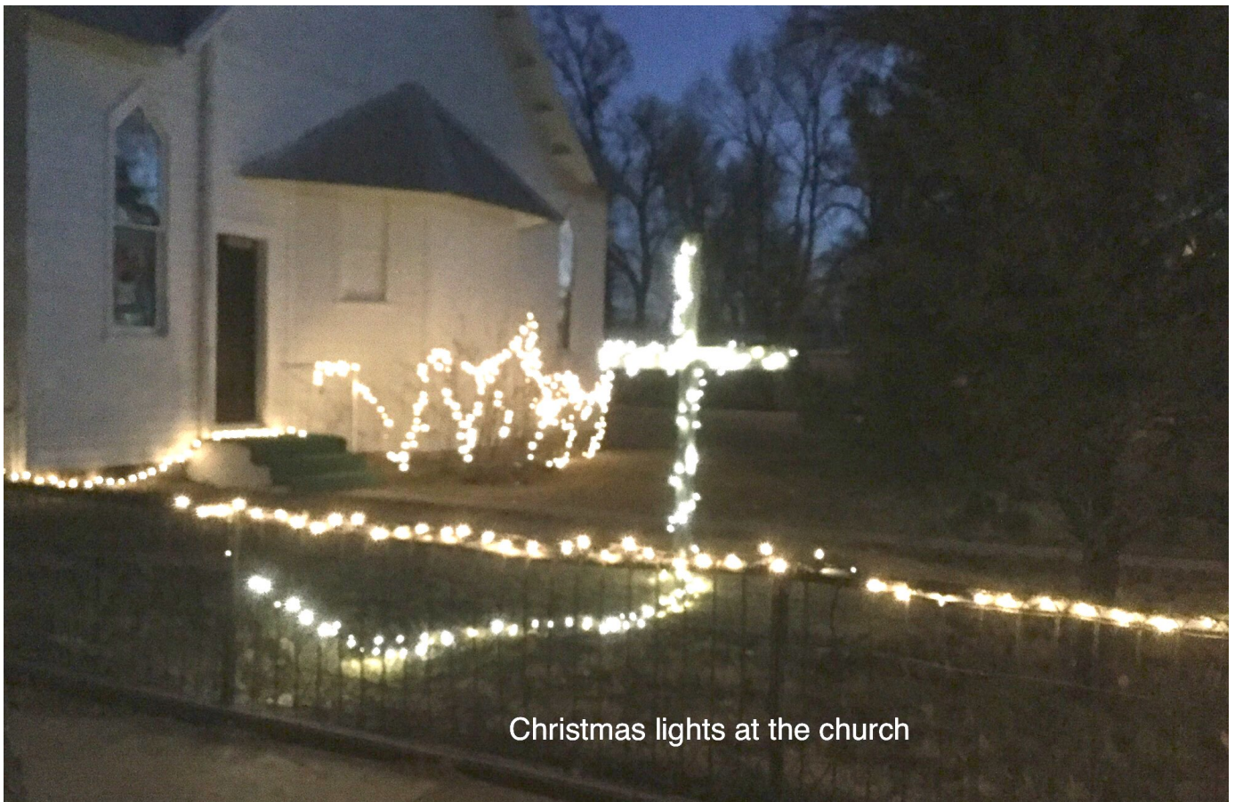
Christmas lights at the church