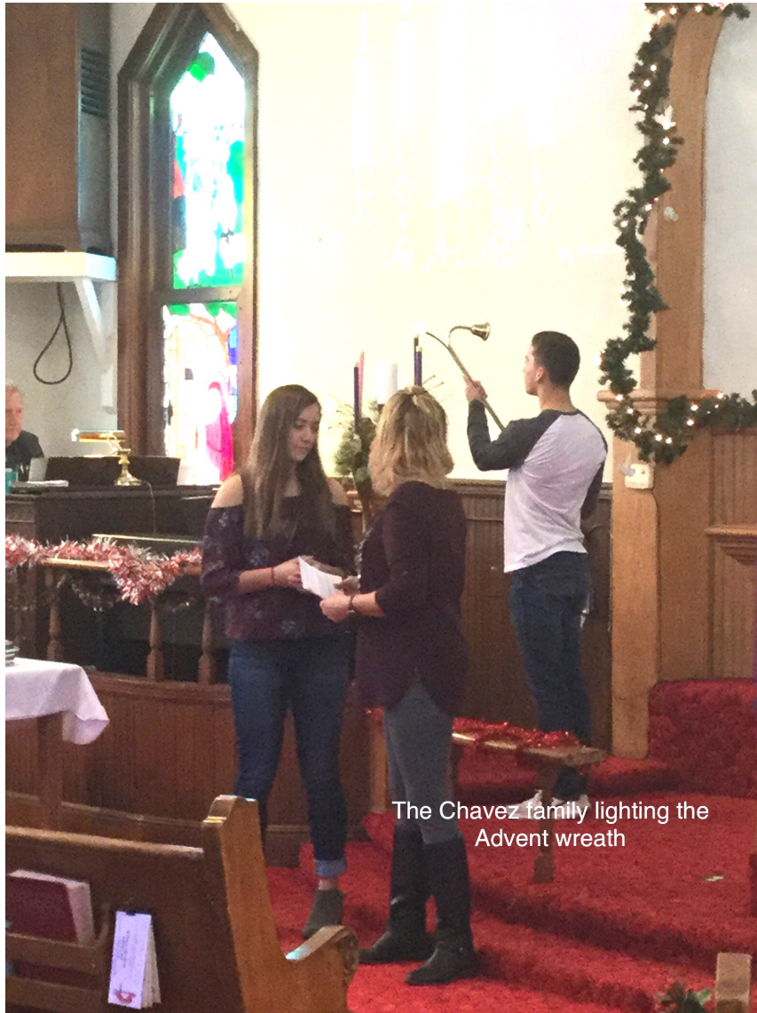
The Chavez family lighting the Advent wreath