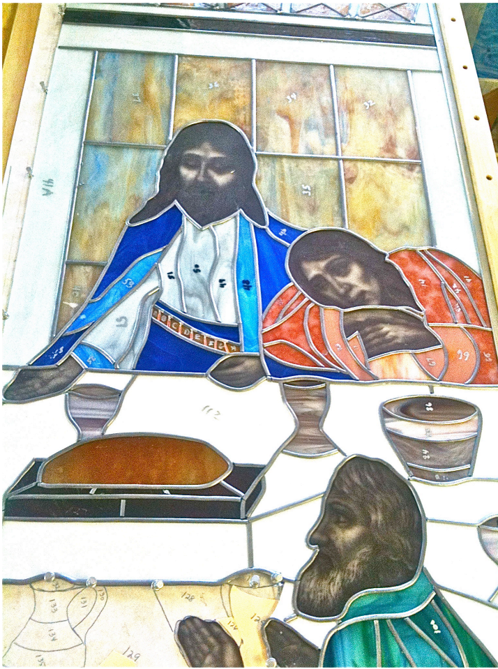
Lord's Supper panel