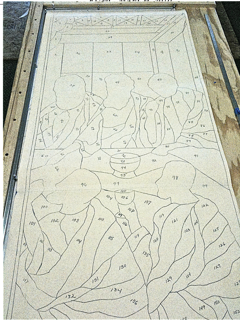
Plans for next Lord's Supper panel