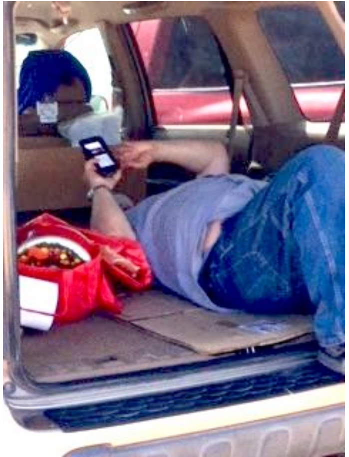
A much-needed break!