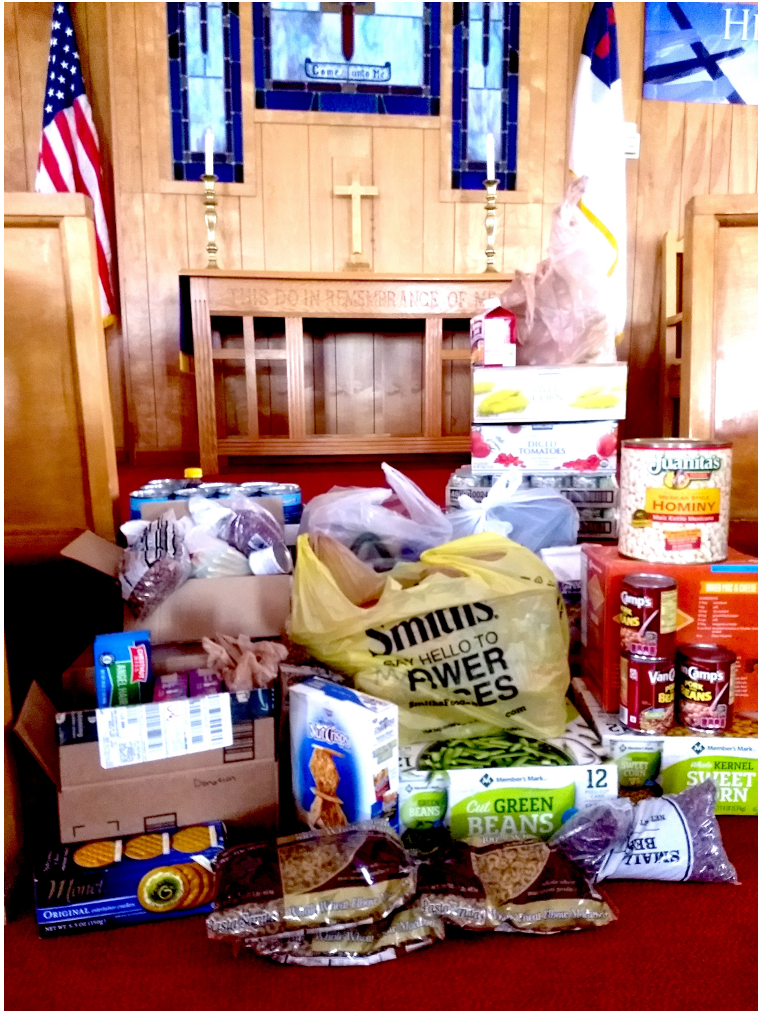
Food (and socks) donated to Bethel Community Storehouse by Mountainair UMC