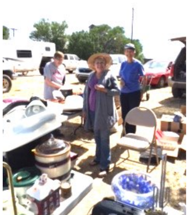
Our friendly sales associates