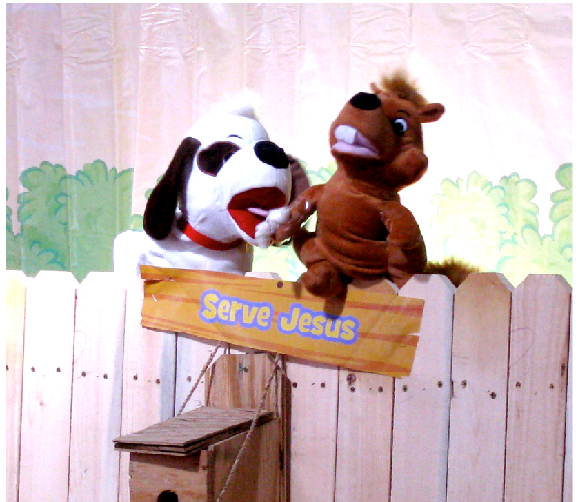
Puppets, Cooper and Nick